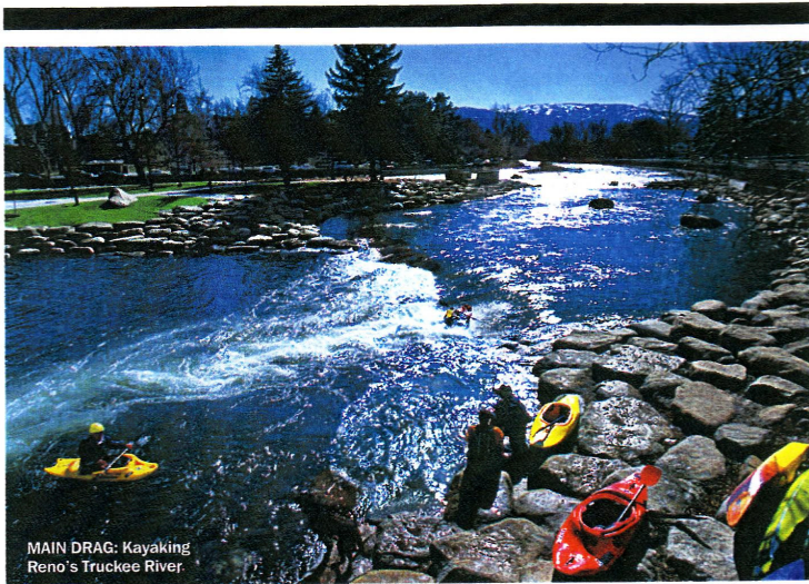
MAIN DRAG: Kayaking Reno's Truckee River.